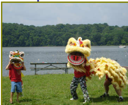
lion dance team