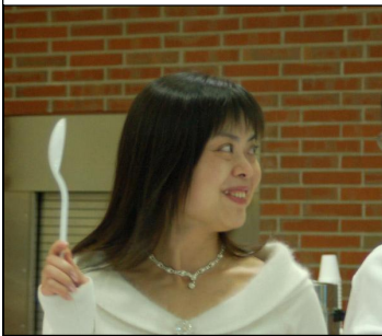
New Year event