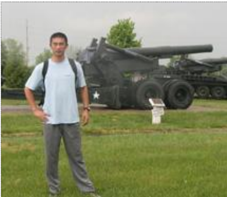
A picture with Army weapon systems