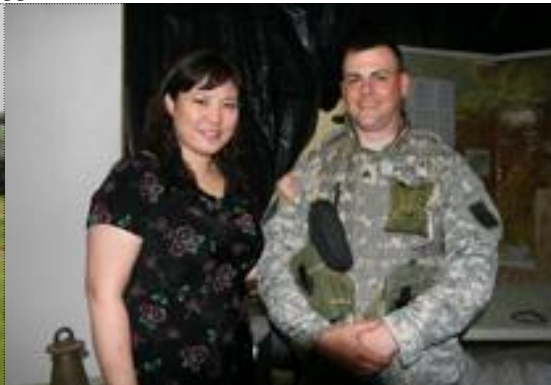
Quick tour of military facilities