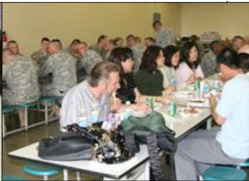
Lunch with soldiers