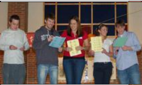
Butler Chinese Language Students