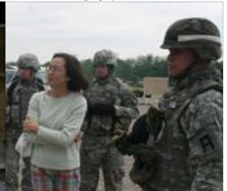
Tour the base