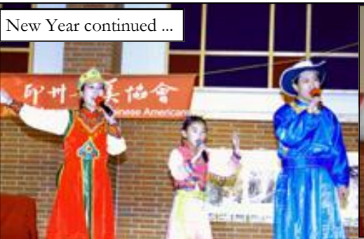
Three Treasures by the Yin family