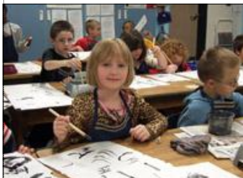
Students enjoying Chinese calligraphy