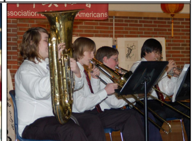
Clay Middle School